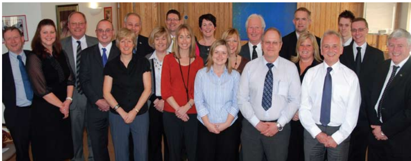
The IMI Awards team

This will be done through our regular centre e-mails, the website and IMI AWARDS NEWS .